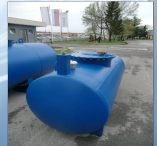
PNP (mobile oil pump)