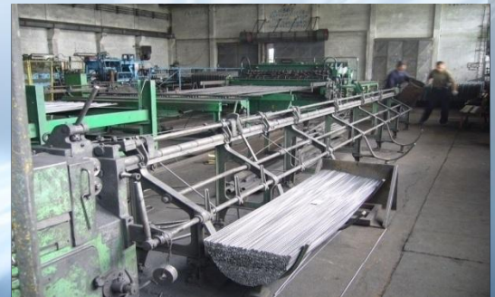
Straightened and cut wire