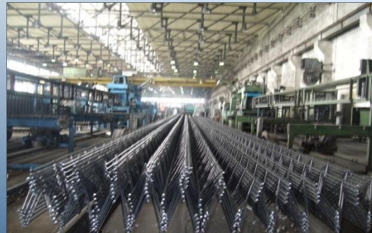
Lattice girder - BINOR