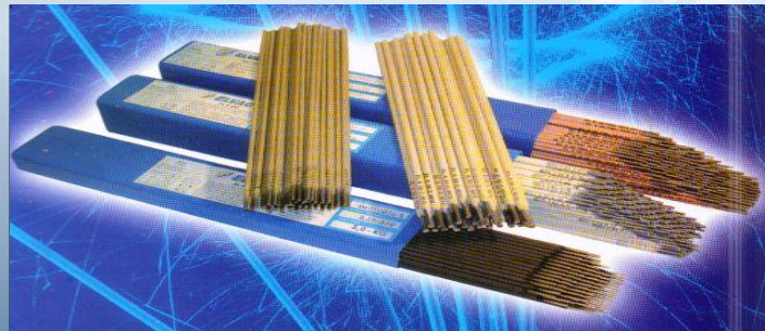
Classical and special welding electrodes