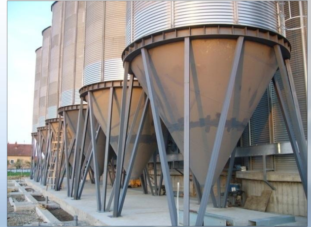
Silos for grain storage