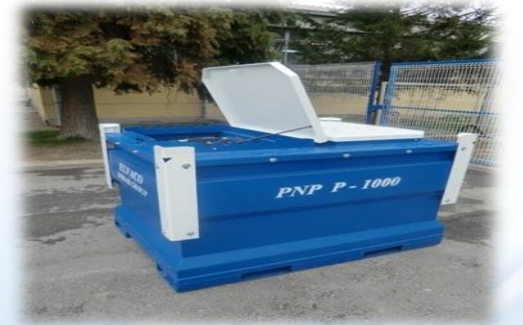
PNP (mobile oil pump)