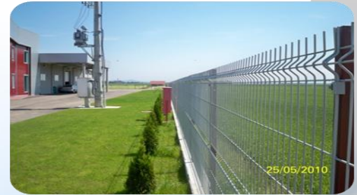
Coated fence panels