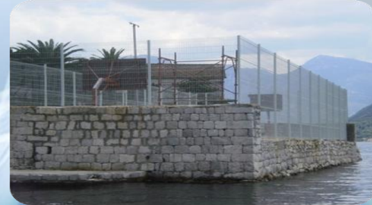
Coated fence panels