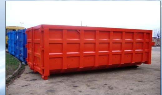
Roll containers for the waste storage