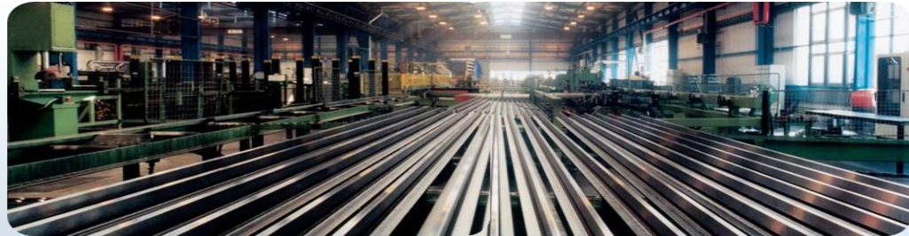
Finished lift guide rails

Production of cold- drawn rail guides is based on the technology of the Italian company MONTEFERRO