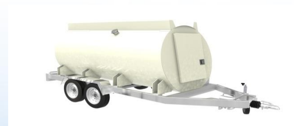
Mobile kerosene pumps