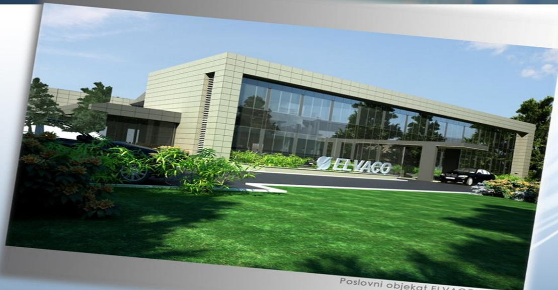
Poslovni objekat ELVACO, Bijeljina