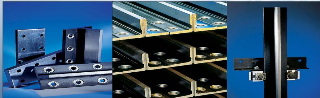
Finished lift guide rails

Production of cold- drawn rail guides is based on the technology of the Italian company MONTEFERRO