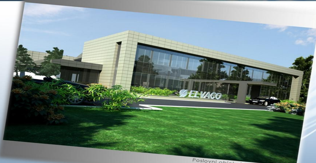
Poslovni objekat ELVACO, Bijeljina

Tel: +387 55 209 299 +387 55 202 286 Fax: +387 55 225 291